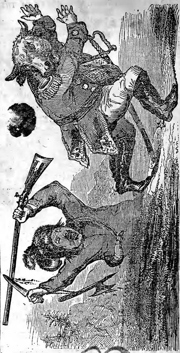
THE GHOST OF CROCKETT SCARING JOHN BULL FROM OREGON.